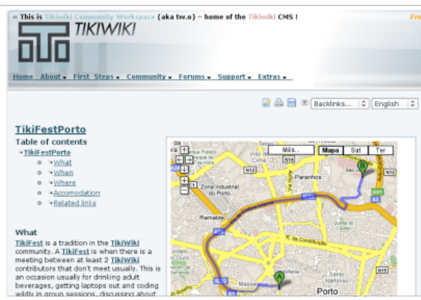
=> Embedded external dynamic content inside a Wiki page

Dynamic Content Admin explains the step to produce it.