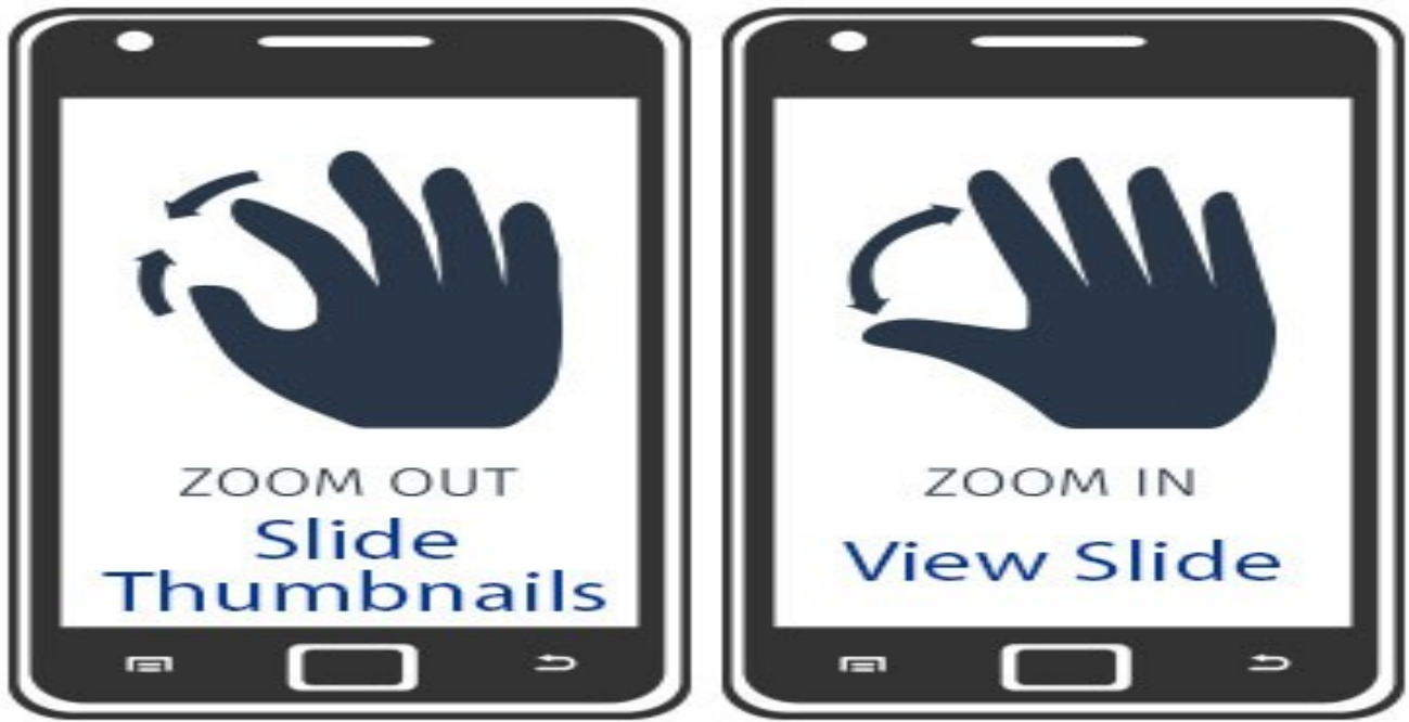
Tiki Plugin Slideshow Vector Graphics Designed by macrovector / Freepik