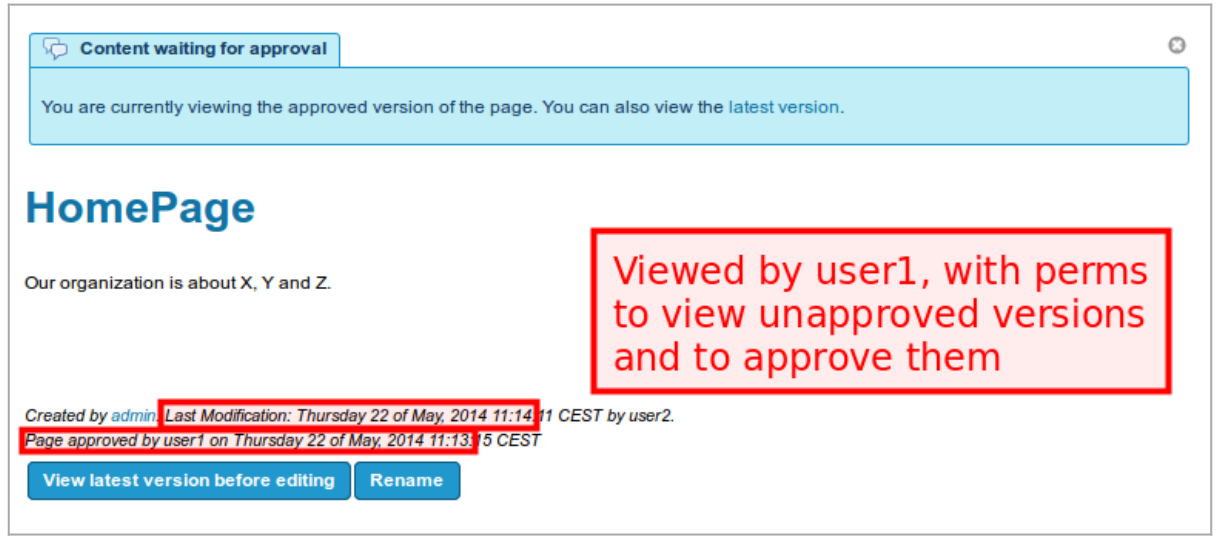
Click to expand

When user1 clicks to see the "latest version", that is the page shown: