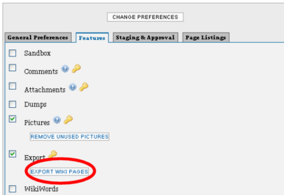
Wiki Export feature on the Features tab of the Admin: Wiki page.

Enable the Export option on the Features tab of the Wiki Administration page: