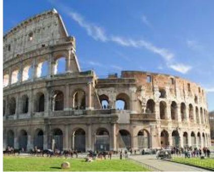
Colosseum, Rome, Italy

Colosseum, giant amphitheatre built in Rome under the Flavian emperors.