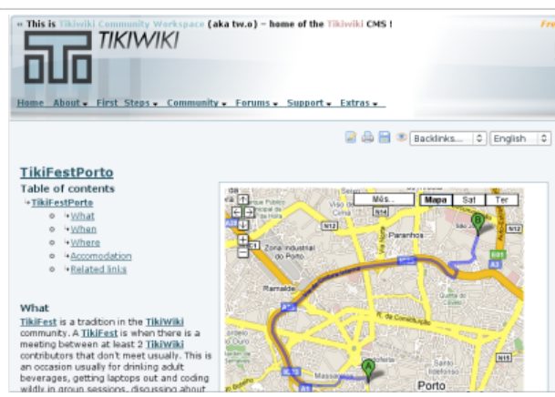
=> Embedded external dynamic content inside a Wiki page

Dynamic Content Admin explains the step to produce it.