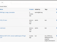
Kaltura list-media screenshot

Kaltura integrates with several applications, including Tiki. (Tiki is tested with both Kaltura CE and Kaltura hosted services.) The Tiki-Kaltura integration was started in Tiki4 as a "Google Summer of Code" project, and has since evolved.