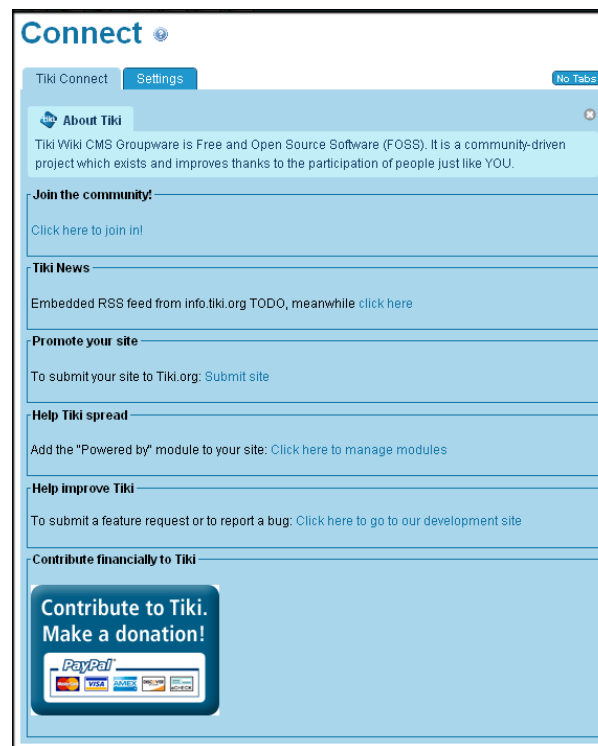
Tiki Connect tab