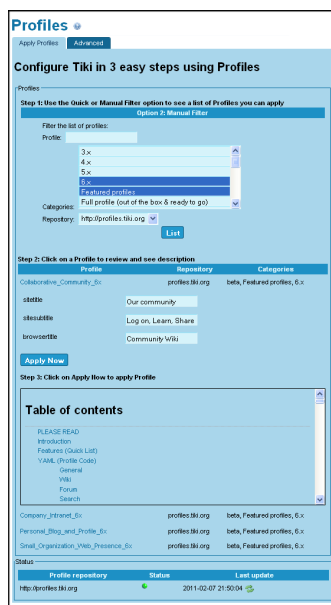
Apply Profiles tab