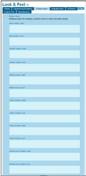
Shadow Layer tab